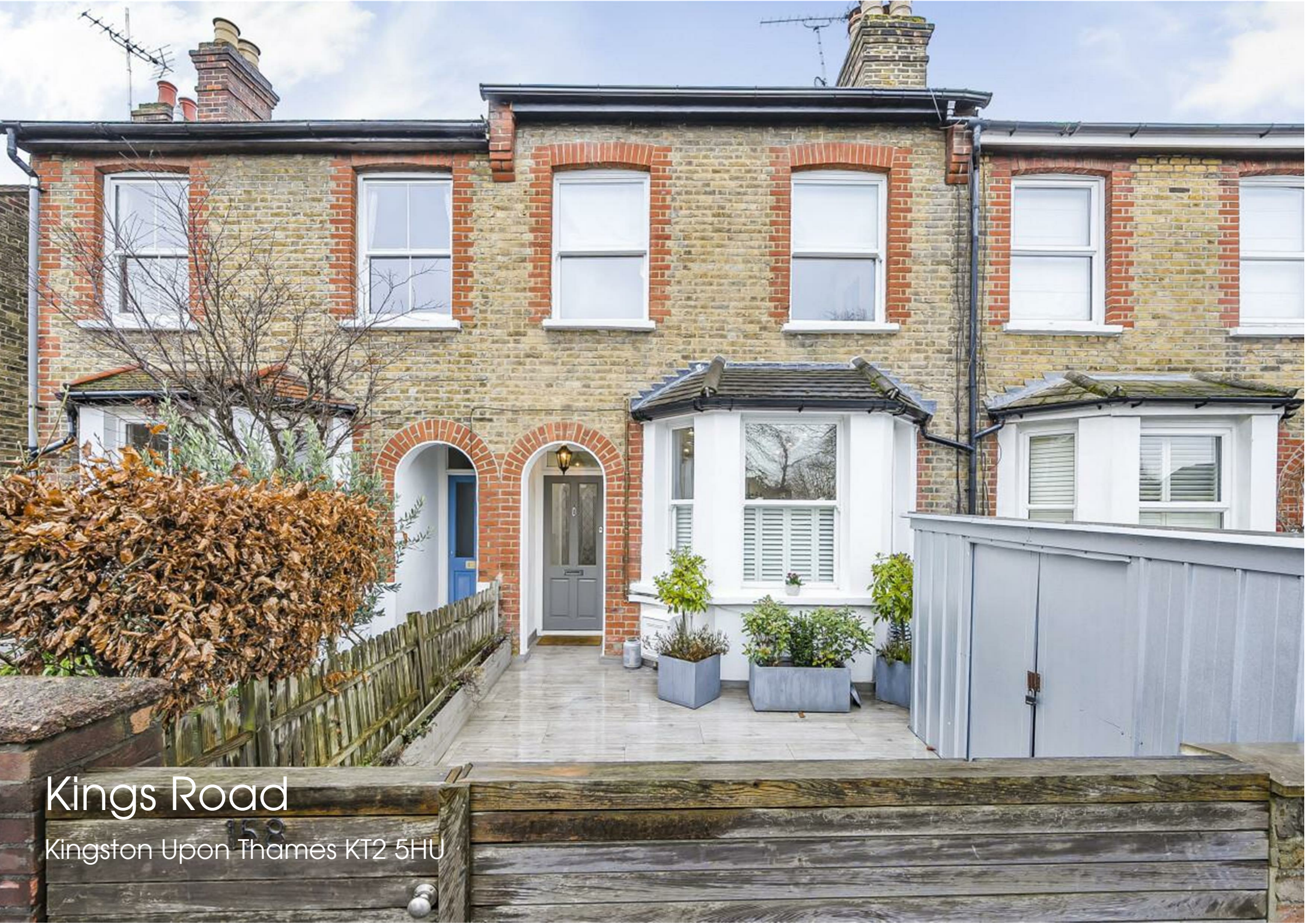
Kings Road Kingston Upon Thames KT2 5HU